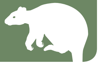
TABLE 1. Threatened and near-threatened animal species associated with Lumholtz’s tree-kangaroo habitat.