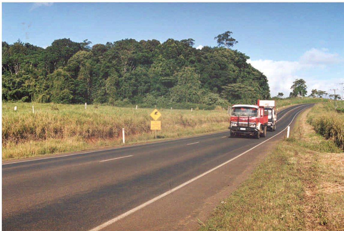
Photograph 4. The main Malanda to Millaa Millaa road situated close to tree-kangaroo habitat in a rainforest fragment.

These are the areas where actions to prevent road-kills need to be targeted.