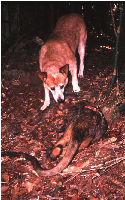
Photograph 5. Dingo with dead tree-kangaroo