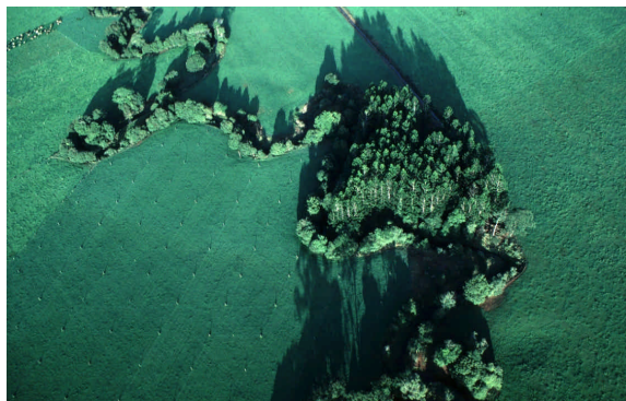
Photograph 7. Aerial view of a narrow rainforest riparian strip plus plantation along a creek meandering through grassy paddocks.