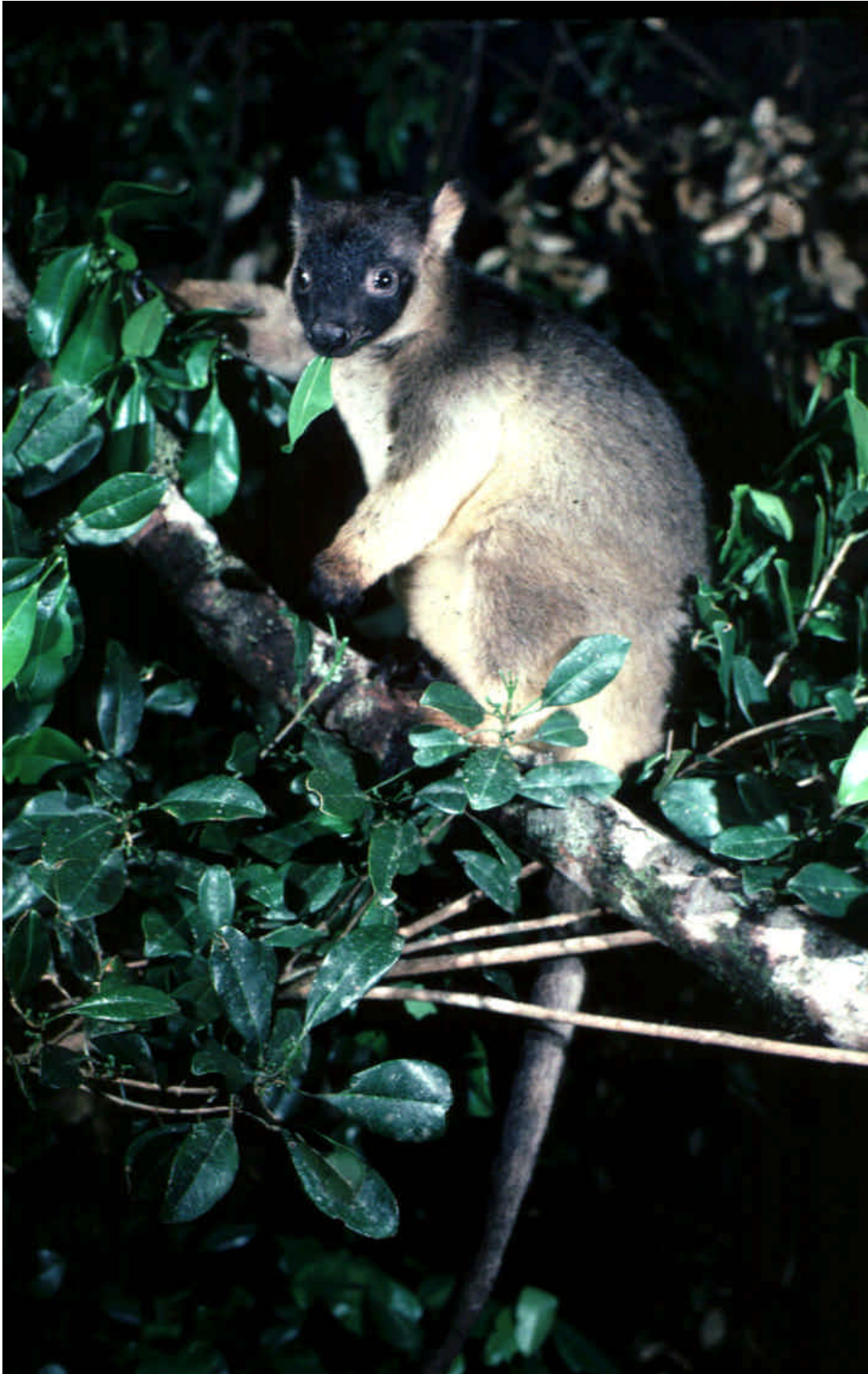
Photograph 1. Lumholtz's Tree-kangaroo eating a leaf. Note black face, pale forehead, black paws and long pendulous tail.