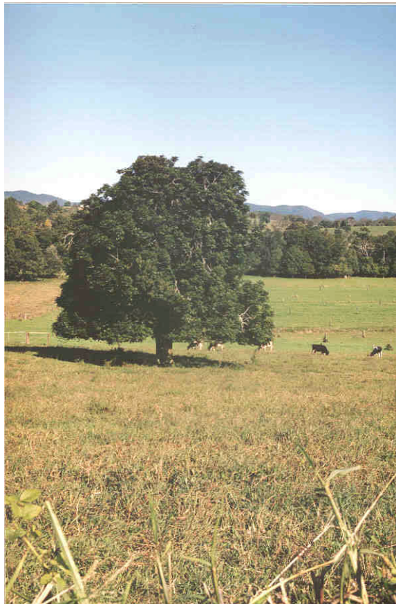
Photograph 6. Solitary tree in paddock can act as a refuge for a tree-kangaroo.