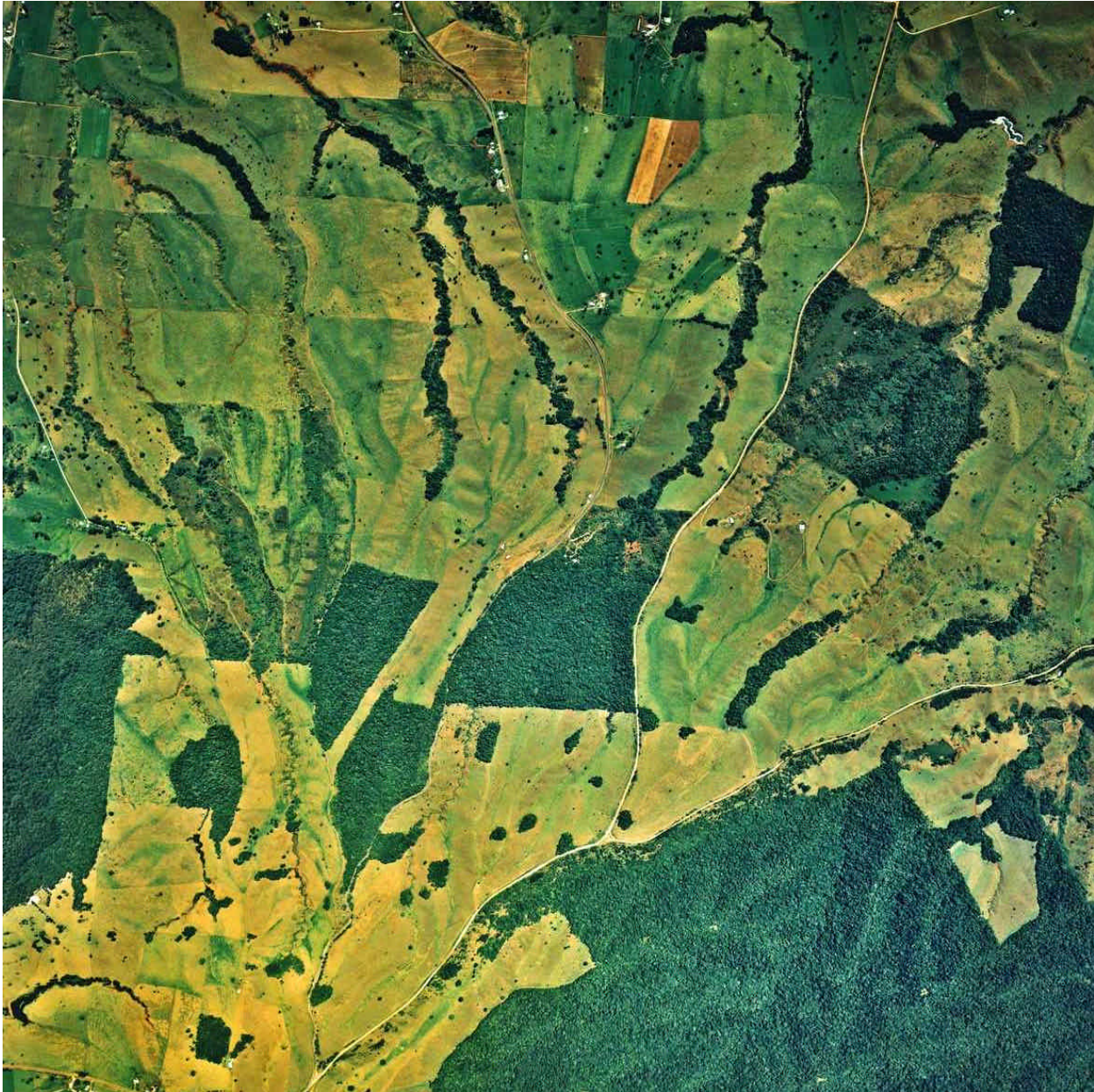
Photograph 2. Aerial photograph of Upper Barron, Atherton Tableland, with numerous rainforest fragments of varying sizes and thin riparian strips of forest along the creeks

The Atherton Tablelands is situated in the mountain ranges behind Cairns in far north Queensland, Australia. Much of its original forest cover was cleared in the early part of the 20 th century for agriculture and dairying due to the rich volcanic soils 26 . The remaining vegetation exists as forest fragments across the predominantly agricultural landscape (Photograph 2 and 3). There are also significant areas of forest on the steep slopes to the east and south of the Tablelands, which are protected as part of the Wet Tropics World Heritage Area.