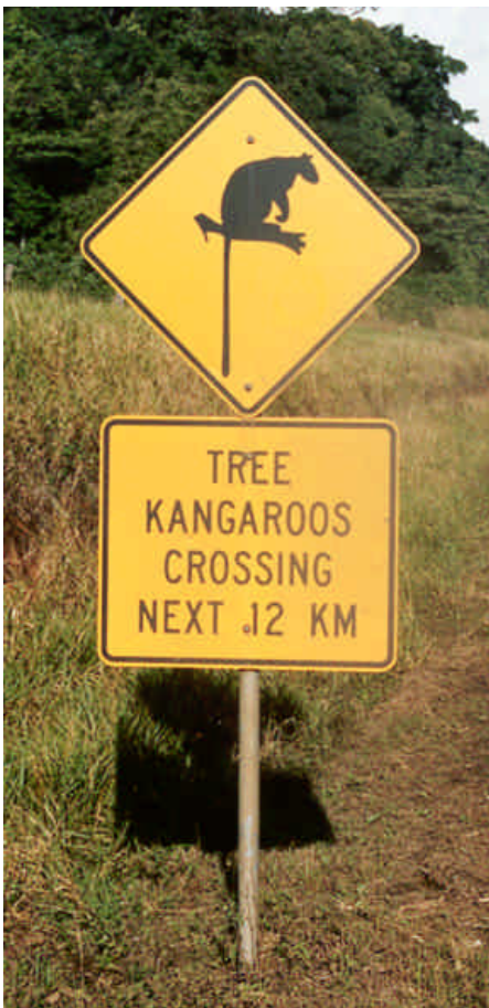
Photograph 8. Tree-kangaroo road sign.